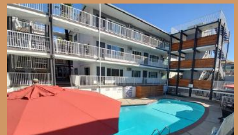
AMBERWOOD APARTMENTS S. Pasadena - AmberwoodFusion.com