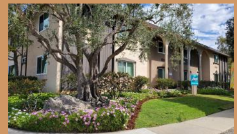
ARMADA APARTMENTS Ventura - ArmadaFusion.com