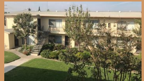
DRESDEN COURT APARTMENTS Anaheim - DresdenFusion.com

We are very excited to have three new communities added to our mix - Stay tuned for the upcoming websites to learn more: